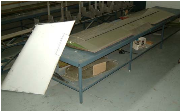
The elevator & stabilizer are ready for painting. The rudder has been painted.