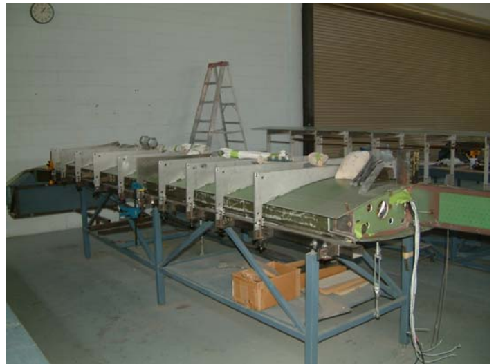
The wings were put back in the assembly fixture to bond the aft top skin.

We removed the wings after all the fit-up was complete. Then we closed the wings by bonding the aft top skin. In a few days, we will finish the sponsons (wing tip floats) and the wings will be prep and painted.